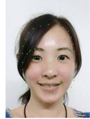
Figure 2. Image annotation