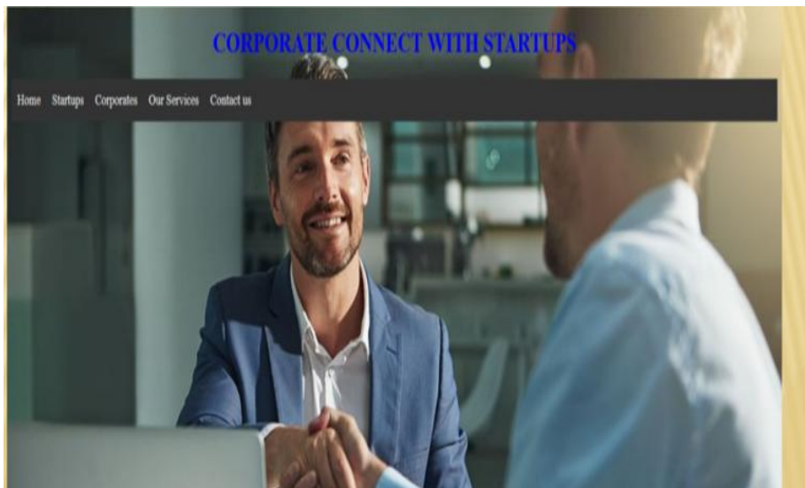
Fig.1:Collaboration between corporate and startup