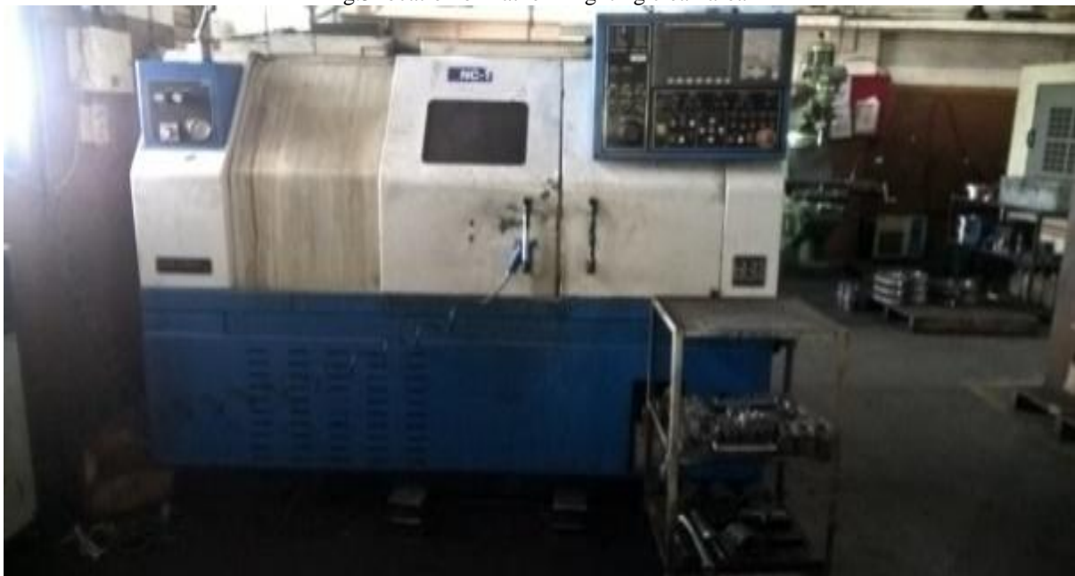
Fig.6 location of CNC in lighting clean area