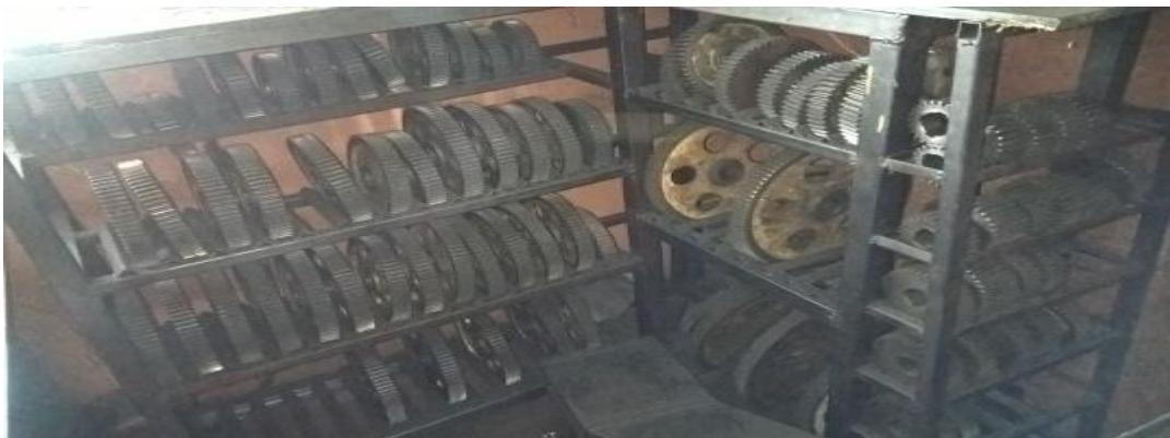
Fig.3 Jobs Store in Racks