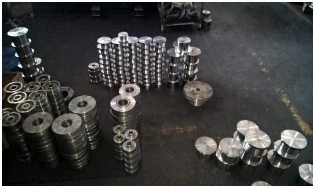
Fig.4 Jobs Placed as per order