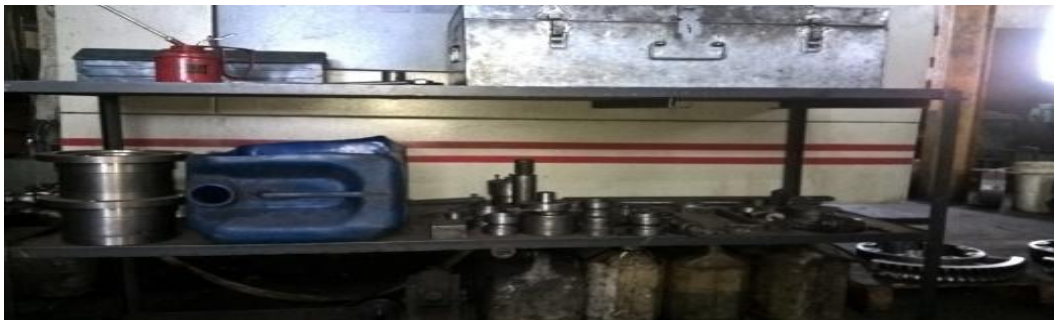
Fig.2 Tool Storage Set in Order