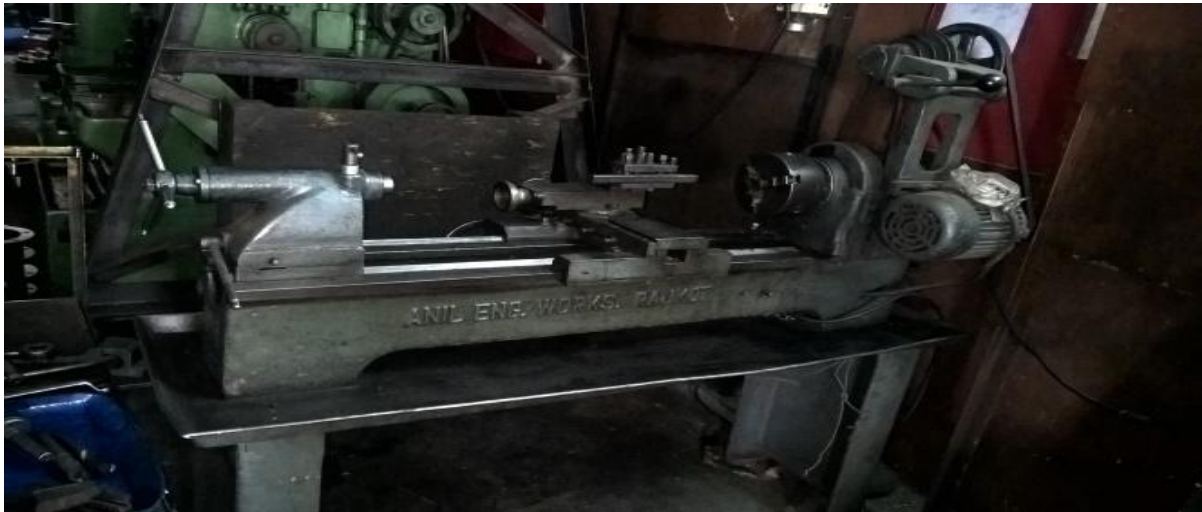
Fig.5 location of Lathe in lighting clean area

The third S stresses on cleanliness because it ensures a more comfortable and safer workplace, as well as better visibility, which reduces retrieval time and ensures higher quality work, product or service. All equipment malfunction or defects must be fixed or reconditioned. The key word in this description is keeping the workplace and everything in it clean and in good functional condition. This is achieved through the combination of the cleaning function and defect detection.