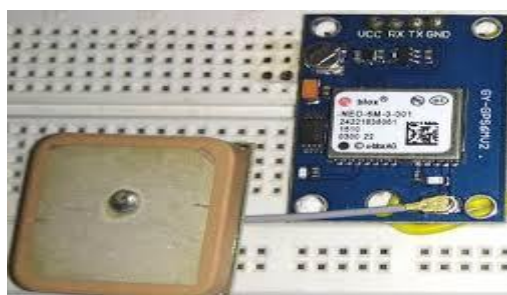
Fig: GPS interfacing with Node MCU

Global Positioning Satellite (GPS) are mostly used in smartphones and in the military to track the location. It uses satellites and the ground stations to find the position on earth. It is also called as navigation system.