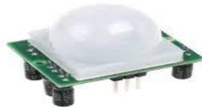
Fig: PIR sensor

A passive infrared sensor is a sensor which is used to measure the infrared light radiating from objects in its field of view. They are mostly used in the PIR-based motion detectors. These types of sensors are most commonly used in security alarms and automatic applications based on the lightening.