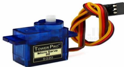
Fig: Servomotor SG90

A servo motor is a device which is used to push and object and it is also used to rotate an object. If we want to rotate an object at some specific angles or distance, then we use the servo motor. It is made up of simple motor which run through servo mechanism.