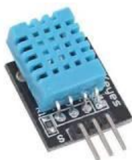
Fig: Temperature sensor

A fire detector is used to detect the smoke or heat. These devices will respond only to the presence of smoke or extremely high temperatures that are present with fire. A temperature sensor is an electrical device which is used to collect the data about temperature from a particular source and then converts the data into form which is understandable for a device or user.