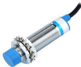
Fig: Proximity sensor

A proximity sensor is a sensor which is used to detect the presence of nearby objects without any physical contact with the object. It will emit a beam of electromagnetic radiation like infrared rays, for instance, and looks for changes in the field.