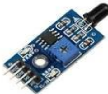
Fig: Fire sensor