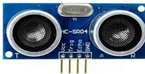
Fig: Ultrasonic sensor

An ultrasonic sensor is a sensor which is used to measure distance to an object using the ultrasonic sound waves. It uses a transducer to send and receive the ultrasonic pulses from the object which relay back information about an object's proximity.