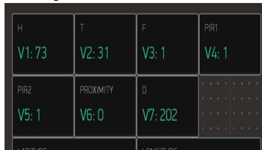
Fig. 2: Alert message is sent to the base station