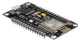
Fig: Node MCU

Node MCU is an open source IoT platform with a low cost. A firmware was included initially which runs on the ESP8266 Wi-Fi SoC, and the hardware is based on the ESP-12 module. Then, support for the ESP32 32-bit MCU was added. The hardware which is used for prototyping is typically used is a circuit board functioning as a dual in-line package (DIP) which integrates a USB controller with a smaller surface-mounted board containing the MCU and antenna. The DIP format allows for easy prototyping on the breadboards. The design was initially based on the ESP-12 module of the ESP8266, which is a Wi-Fi SoC integrated with a Tensilica Xtensa LX106 core, which is widely used in IoT applications.