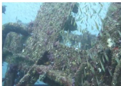
Figure 2: Input Image

The simulation of our proposed work is based on image fogging, blurriness and light absorption against the DCP and the MIP based methods. The proposed method attains a more accurate TM and BL selection and presents a more precise color restoration result. It is better in all the tested underwater color tones.