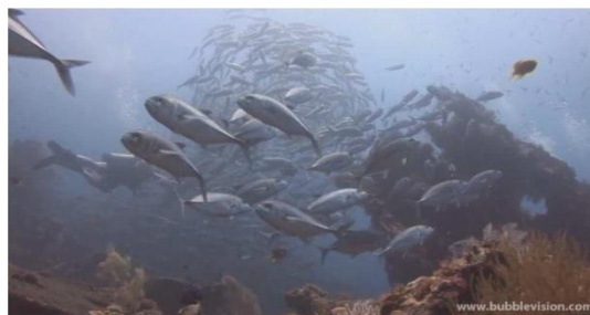
Figure 4: Haze removed Image1