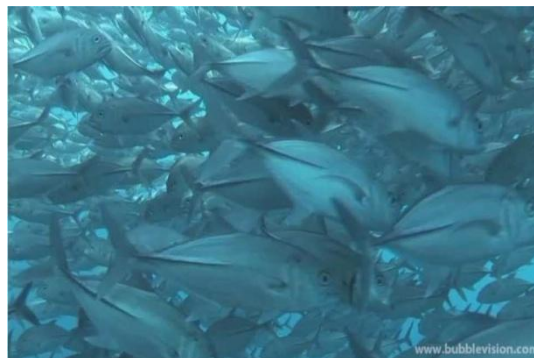
Figure 3: Depth Estmiated Image