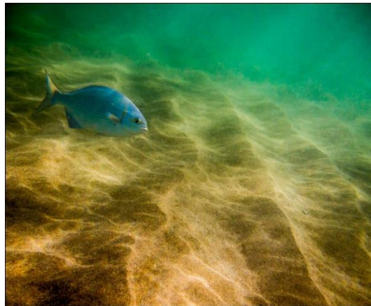
Figure 6: Output Image