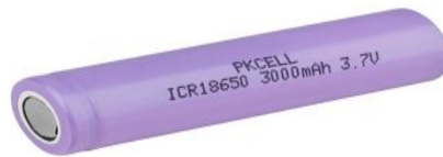
Fig2. Lithium ion battery