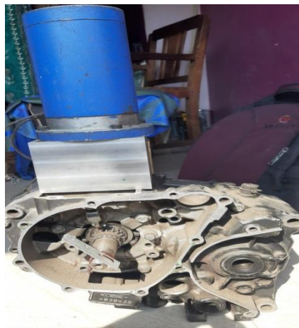
Fig4. BLDC motor