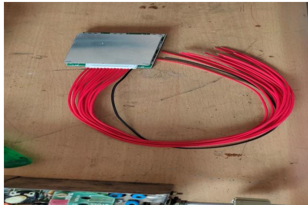
Fig6. Battery management system(BMS)

A battery management system can be comprised of many functional blocks including: cutoff FETs, a fuel gauge monitor, cell voltage monitor, cell voltage balance, real time clock (RTC), temperature monitors and a state machine. There are many types of battery management ICs available. The grouping of the functional blocks varies widely from a simple analog front end that offers balancing and monitoring and requires a microcontroller (MCU), to a standalone, highly integrated solution that runs autonomously.