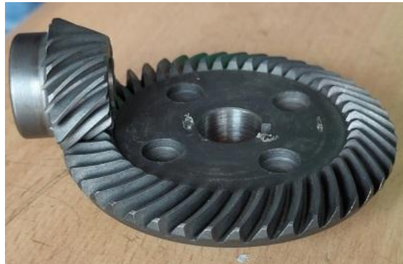
Fig7. Spiral Bevel type assemble