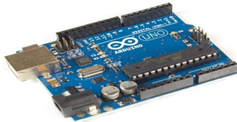
Figure B: Arduino Uno

Arduino microcontrollers are pre-programmed with a boot loader that simplifies uploading of programs to the on-chip flash memory. The default bootloader of the Arduino UNO is the optibootbootloader. Boards are loaded with program code via a serial connection to another computer. Some serial Arduino boards contain a level shifter circuit to convert between RS-232 logic levels and transistor–transistor logic (TTL) level signals. Current Arduino boards are programmed via Universal Serial Bus (USB), implemented using USB-to-serial adapter chips such as the FTDI FT232. It is open source and the Arduino Uno is widely used open source micro controller board based on the microchip ATmega 328p microcontroller. The board is equipped with sets of digital and analog input/output (I/O) pins that may be interfaced to various expansion boards and other circuits. The board features 14 Digital pins and 6 Analog pins. Operating Voltage at 5 Volts, Input Voltage at 7 to 20 Volts, Clock Speed at 16 MHz, in that 32 KB flash memory, 2 KB SRAM and 1 KB EEPROM.