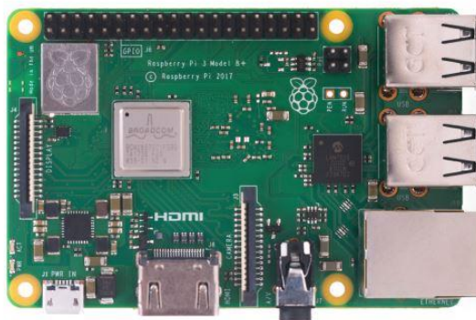
Fig 3 Raspberry Pi 3 Model B+

capability via a separate PoE HAT The dual-band wireless LAN comes with modular compliance certification, allowing the board to be designed into end products with significantly reduced wireless LAN compliance testing, improving both cost and time to market. The Raspberry Pi 3 Model B+ maintains the same mechanical footprint as both the Raspberry Pi 2 Model B and the Raspberry Pi 3 Model B.