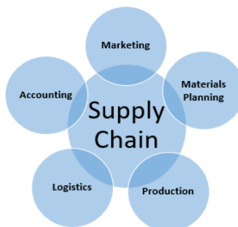
Fig 1. The major entities in a Supply Chain

Supply Chain is a concept at an enterprise level to manage all the business entities in a single framework to provide better visibility of any business function to any stake holder at any time. There are many business functions or processes within the Supply Chain and it is the business or enterprise level decision to determine in choosing the modules or functions that need to be on the Supply Chain as it provides the greater flexibility. And, there are leaders now in the market in the IT applications in providing the seamless service to their customers on their Supply Chain portfolio.