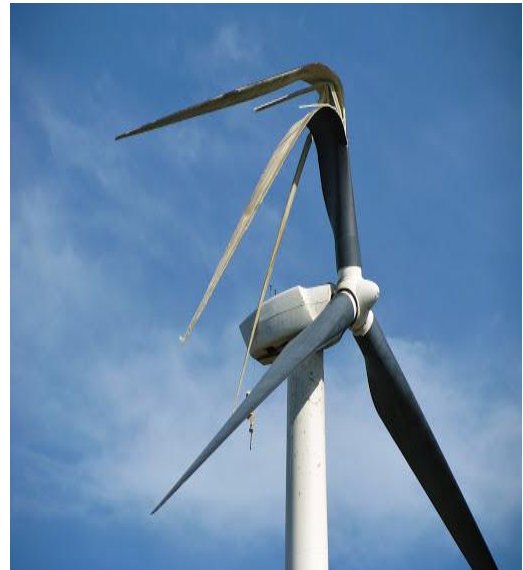
Fig 3: Turbine Blades Failure.