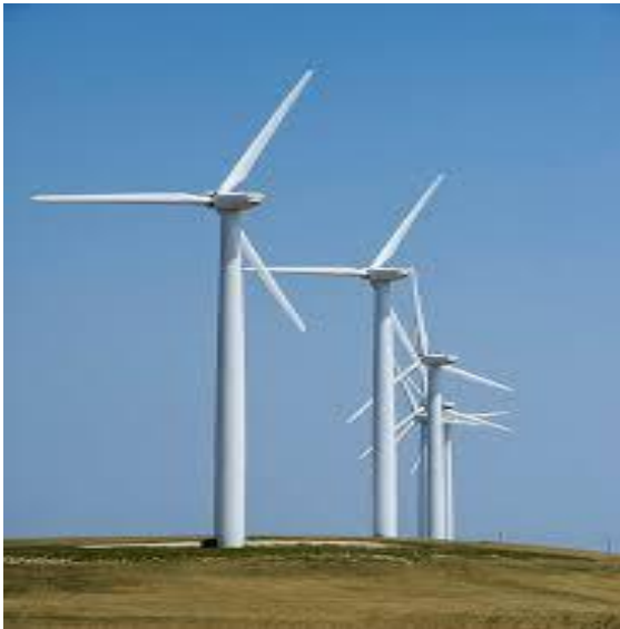
Fig 2: Working In Good Condition.