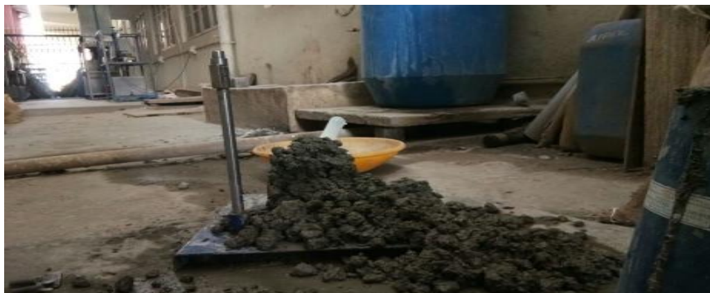
Figure 1 : Slump Test