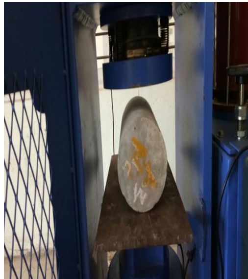
Figure 3: Tensile Test

P = applied weight in kN D= Dia of the cylinder in mm L = Span of the cylinder in mm