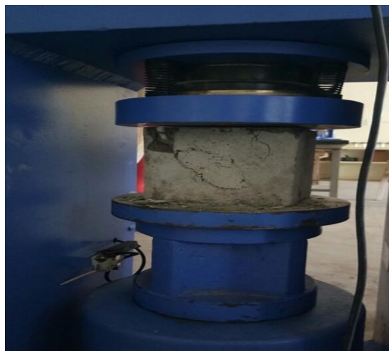
Figure 2 : Split Tensile Test

For these test cylinders of 150mm diameter (D) and 300mm height (H) are casted. These specimens are placed horizontally between the plates of compression testing machine and maximum load(P) at which specimen fails is noted and tensile strength is calculated using formula,