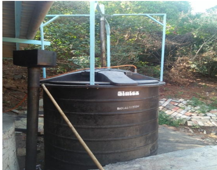
Figure1. Bio Gas Plant at SanviPune