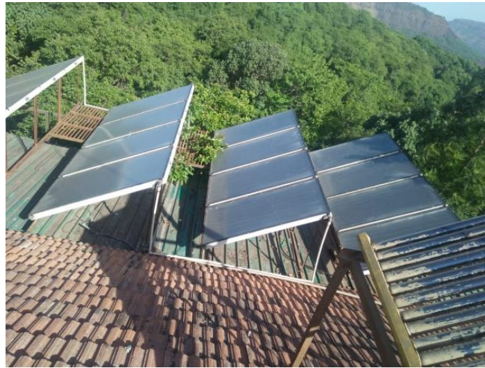
Figure 3. Photovoltaic (Solar) Cells

India is endowed with abundant renewable energy resources, like biomass, wind, small and large scale hydro with potential for hydrogen fuel, geothermal and ocean energies. Except for the large scale hydropower generating station which serves as a major source of electricity, the current state of exploitation and utilization of renewable energy resources in the country is very low. The main constraint in the rapid development and diffusion of technology for the exploitation and utilization of renewable energy resources in the country is the absence of appropriate policy, regulatory and institutional framework to stimulate demand and attract investors. The comparative low quality of the systems developed and the high initial upfront also constitute barriers to the development of these systems.