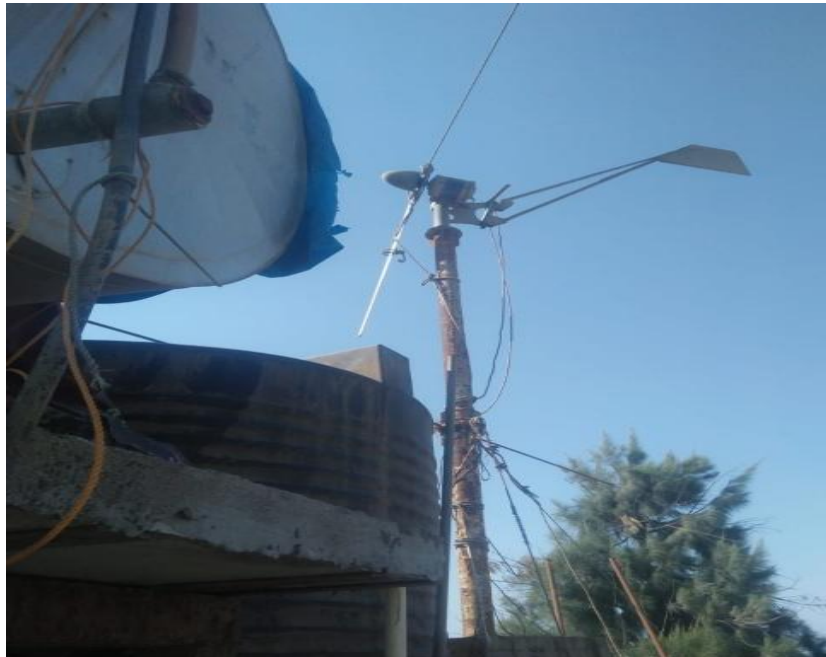
Figure 4. Wind Turbine Energy

A small wind electric system will work for you if: