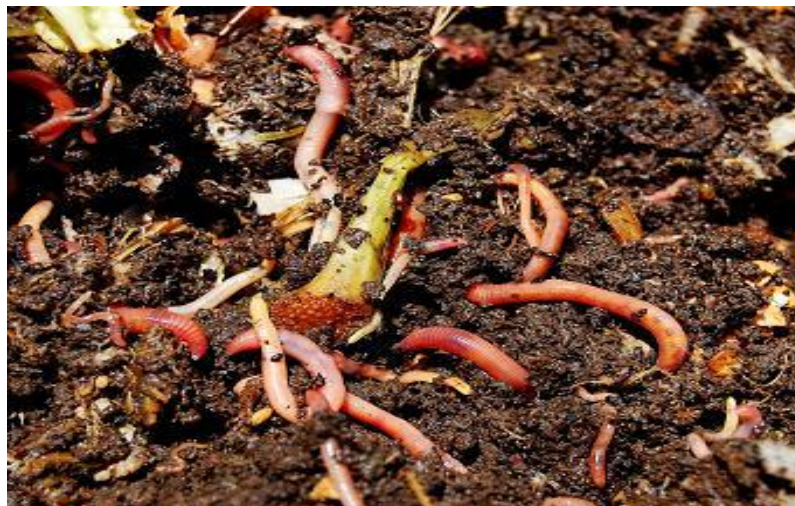
Figure 2: Vermi Composting