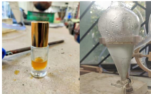
Fig.5: Final (rhizome oil) product bottle and Oil layer formation