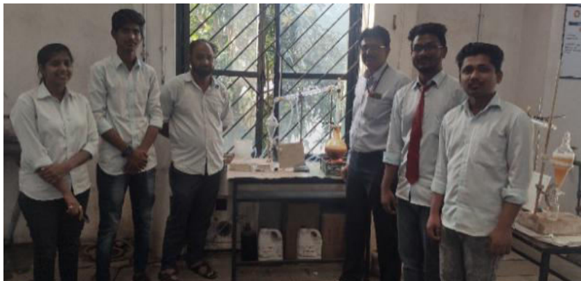
Fig. 4: Team Members Carrying Research Work With Setup