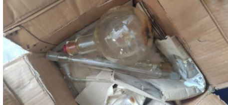
Fig.2: Distillation setup (before installation)

required constituent present in the rhizome. For distillation process, we need continuous cool water supply to condenser for condensation of the steam or vapour of rhizome and water mixture.