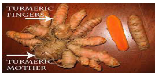
Fig.1: Fresh Turmeric Mother and Their Fingers

In this project our methodology is to make organic essential oil by using basic raw materials found from various different species of turmeric plant with their rhizome roots. In addition we use water with rhizome powder in wet form with the help of references, we studied the main constituents present in the above plant rhizome is benefited for making useful essential oil. The stepwise procedure we conducted from basic raw materials to final desired product are as follows: Firstly we collect all the basic fresh rhizome from turmeric plant plants. Then wash with normal water, the purpose of washing rhizome is to remove the dust and pollution externally stick on the surface of rhizome. After complete washing of each rhizome, it is cut or chopped into fine size having size up to 3 to 4 mm or in powder form by grinding, the purpose of cutting rhizome into small size is to increase the surface area for better extraction for distillation process. Then we weigh it up to 200 grams of each batch, after weighing this measured quantity of material we insert this chopped rhizome into five litres of round bottom flask and adding 900ml of water in the same container.