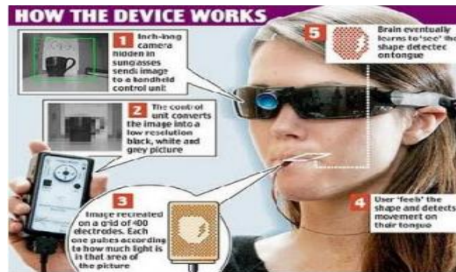
Fig 5: Working of Brain Port device

We can divide the brain port vision device into three stages.