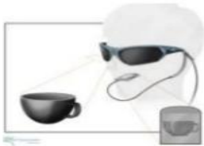
Fig 1: Position of Brain Port device

A lollipop shaped electric device allows a blind to see the objects and this is created by the scientists.