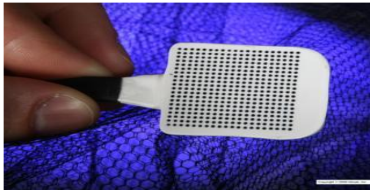
Fig 4: Electrode array

(i) Electrode Array: This electrode is a cubical grade consisting of more than 400 electrodes placed above the tongue. Brain port vision device is the main component of the system that helps in the conversion of images in Grey white and black pictures respectively[6]. Then we release this picture to that electrode that is played on the tongue and send electronic pulses to the tongue matching the intensity of the light of a particular picture in a particular area.