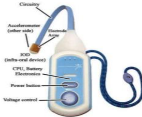
Fig 3: Brain Port Balance

We use it to turn on and off the device.