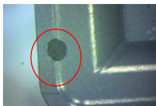
Fig1 Powder Pullout

The first stage of the Six Sigma and DMAIC’s methodology is “define”. This stage aims at defining the project background, identifying the voice of the customer (i.e. customer requirements) and process flow of the project. In Insert Production plant, Powder pullout is observed during pressing of inserts. The term ‘Pullout’ refers to a phenomenon of removal of material from the surface of insert due to adherence of materials onto the punch faces as shown in fig 1