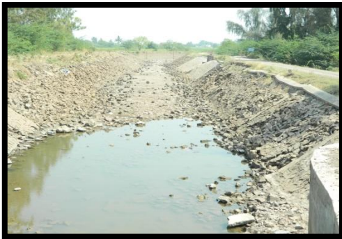
Fig. 1 Failure of canal lining

The main problems that can be found in NLBC irrigation network include; Failure of canal Lining, Seepage through NLBC, Leakage through super passage, Weed growth in NLBC.