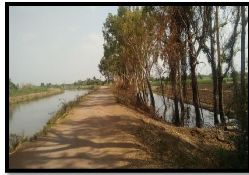
Fig. 2 Seepage through NLBC