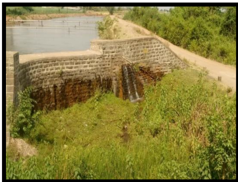
Fig. 3 Leakage through Super Passage