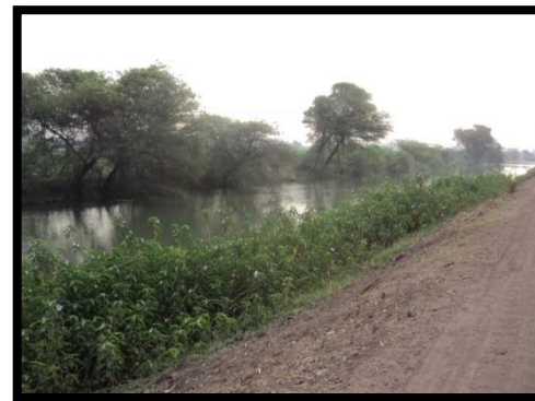
Fig. 4 Weed Growth in NLBC