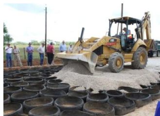
Fig.2 – Laying of Mechanical Concrete Road (MCR)

While filling the TDC with front end bulldozer there pose a serious problem of collapse of side walls of the adjacent cylinder. The aggregates are poured over the cylinder without compaction of the materials used in MCR which helps in maintaining the void ratio providing water to drain off easily, leading to heavy reduction in maintenance of roads. Mechanical concrete roads exhibits exceptional strength to lateral pressure confining the aggregates thereby reducing the cost of maintenance and repair work. The labors used in manufacturing of mechanical concrete roads are unskilled labors hence the construction cost and repair works of MCR is minimum as compared to that of conventional roads.