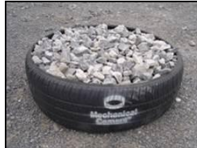
Fig.1 – Confined Aggregates (CA)