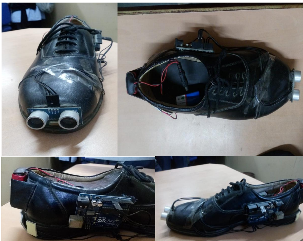
Fig. 3: Different views of the Developed Model of Smart Shoe

The above-shown pictures are the pictorial representation of the developed model. Here the shoe is designed or arranged in such a manner so that it can handle all the required things to work as a helping aid. Smart shoes would be providing a hearing sensation to the person. Wearing this shoe will inform them about the obstacle and provide them with a secure way to the destination. Technology helps the blind people to communicate with the environment. The communication process and the dissemination of information has become very fast. The application results enhance the understanding of the problems facing blind people daily and may help encourage more works targeted to help blind people to live independently in their daily lives. The smart shoes for the blind person will help to reach the destination with the whole navigation system provided in the shoes which will inform the blind person through an earphone.