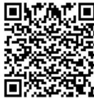
Fig 6.1. QR-Code