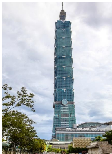
Fig.3. (Jiming Xie 2014)

The aerodynamic optimization approach would be apart when along-wind or across-wind responses have been dealing together. However various approaches that give benefit both, many approaches focus on one and many. For along-wind response optimization, the normal approach is to decrease the drag coefficient by modifying the structure's corners, like making corner chamfering, rounding, and recessing. opening is sometime a feasible option for reducing wind force. By the use of tapering effect in across wind response, since the vortex shedding is inversely proportional to the structure width it is varying building height so that huge frequencies expand over them wide-angle so its effect significantly reduced.