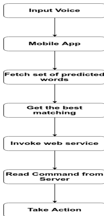
Figure 3. Proposed System

As we know that mobile device contains high quality hardware like MIC, Speaker etc and also there are many libraries available for mobile OS to perform speech synthesis so we are making use of android device as intermediater for predicting word. We are also using webservices so that we can send commands to computer over http and take actions.