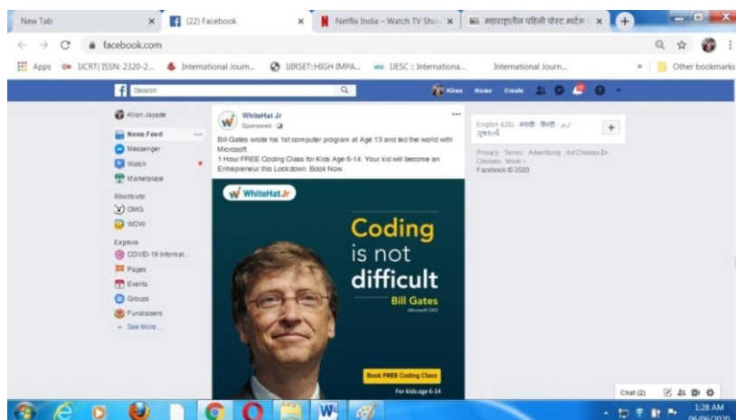
Fig.1. Facebook timeline

Facebook users are over 2.498 billion monthly active users worldwide in the month of April 2020, Facebook is the biggest social network worldwide. In the third quarter of 2012, the number of active Facebook users surpassed one billion, making it the first social network ever to do so. Active users are those which have logged in to Facebook during the last 30 days. During the last reported quarter, the company stated that almost 3 billion people were using at least one of the company’s core products (Facebook, WhatsApp, Instagram, or Messenger) each month.