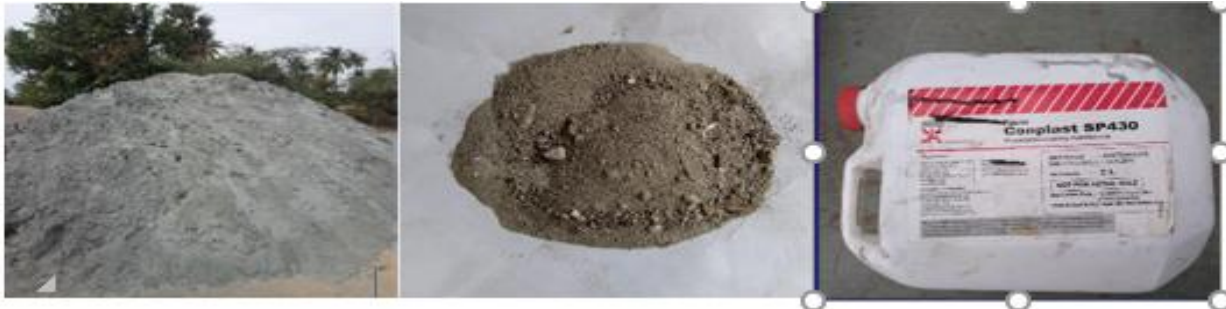
Fig.1 Materials used

The collection of various materials like Ordinary Portland cement (OPC 53 grade), Fine aggregate (M-Sand), Coarse aggregate (20mm) and Super Plasticizer among various place under various conditions.