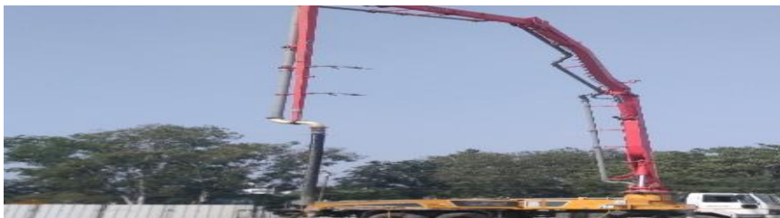
Fig.11 Boom Truck (Crane pouring concrete)

The efficiency depends upon the structure concreting to be done. For a structure like column, the tower crane can lift about 30 cubic meters of concrete per hour.