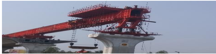
Fig.12 Box Girder Launching Gantry

If the Box Girder Launching Gantry is sudden breakdown for an hour, it will affect the cost of the project as follows