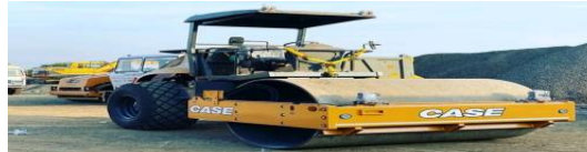
Fig.6 Pneumatic-tire roller

The capacity of Tandem vibratory rollers is 30 cubic meter per hour.