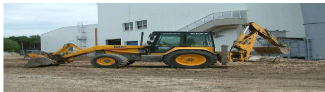
Fig.7 Backhoe loader