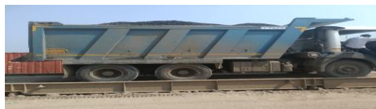
Fig.8 Tipper truck

The capacity of Tipper truck is 252 cubic meter per hour. (25-30 km, 75-90 min for one trip)