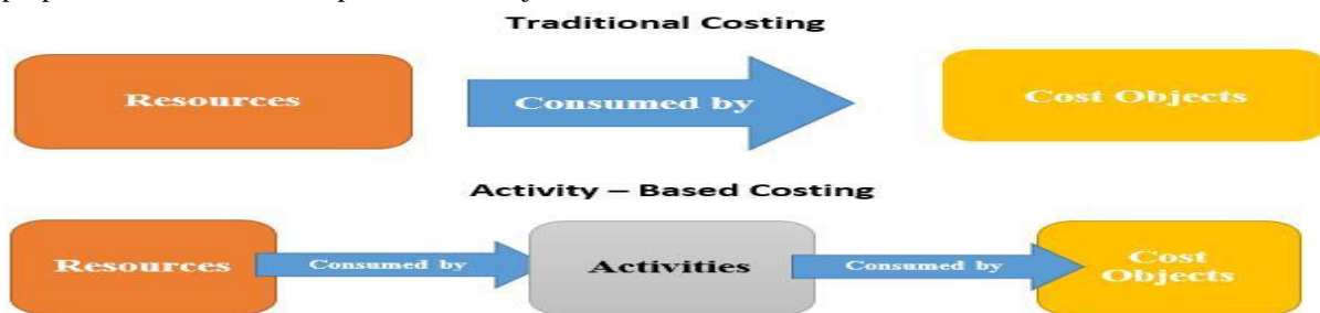
Fig.3. Traditional costing and activity- based costing

ABC model uses different structural blocks in comparison with traditional costing, see figure 3. The traditional costing approach was presented product as a cost object that consumes resources directly. On the contrary, the propose ABC model are adopted the cost objects as a consumer of activities that in turn consume resources.