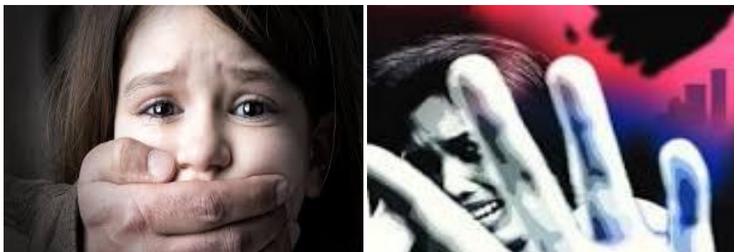
Figure 1: Crime occurrence visualization

Here we have a methodology between software engineering and criminal equity to build up an information mining strategy that can help settle crime quicker. Rather than concentrating on reasons for crime event like criminal foundation of wrongdoer, political ill will and so forth we are concentrating mostly on crime variables of every day.