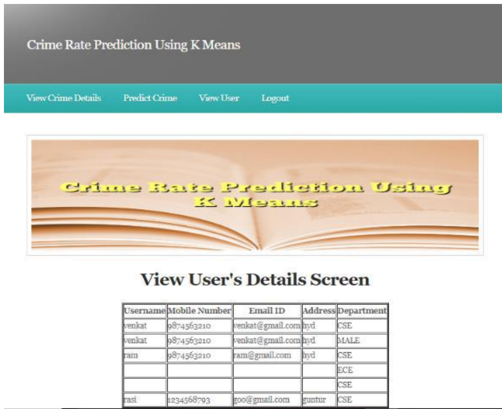
Figure 5: shows the view of users details