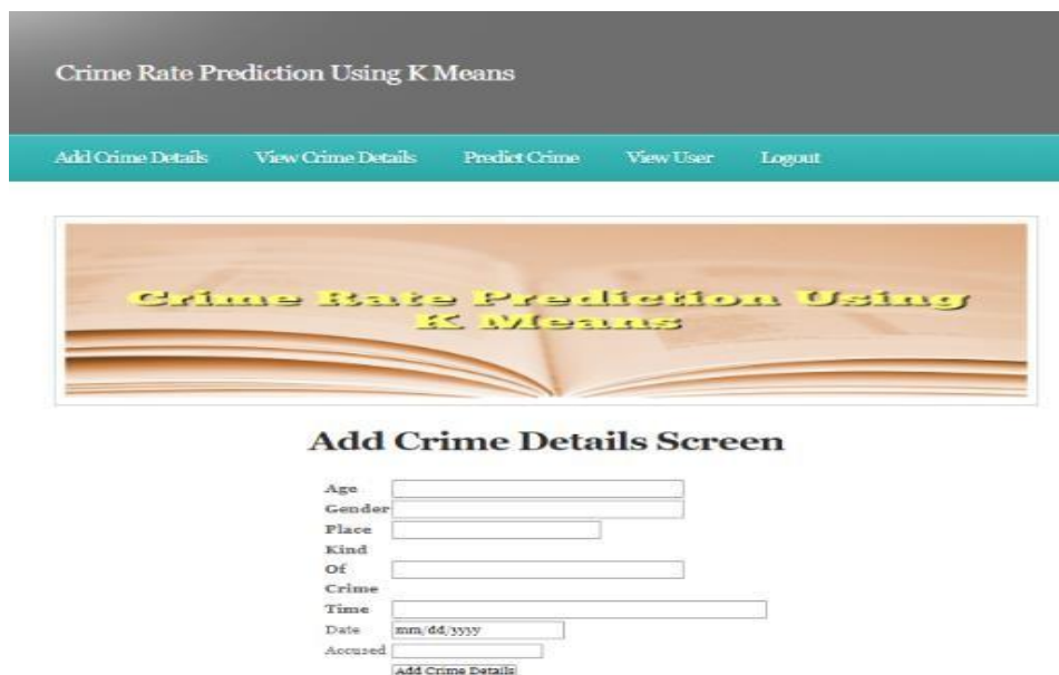
Figure 4: Shows adding crime details