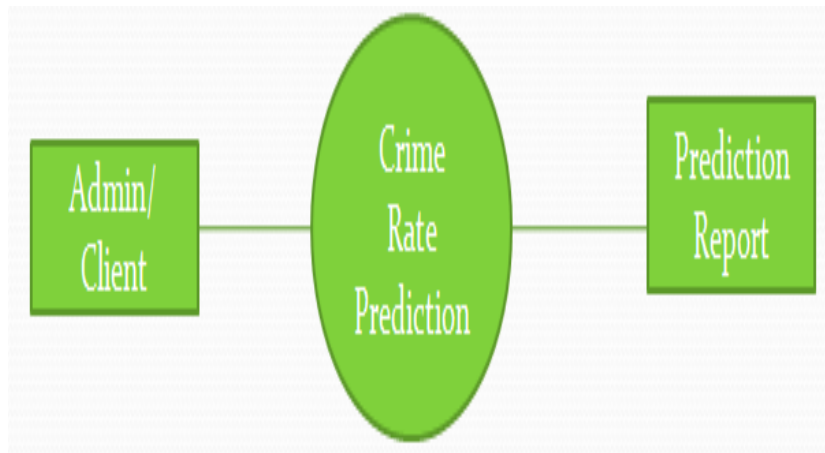
Figure 2: Reference Model of Proposed System