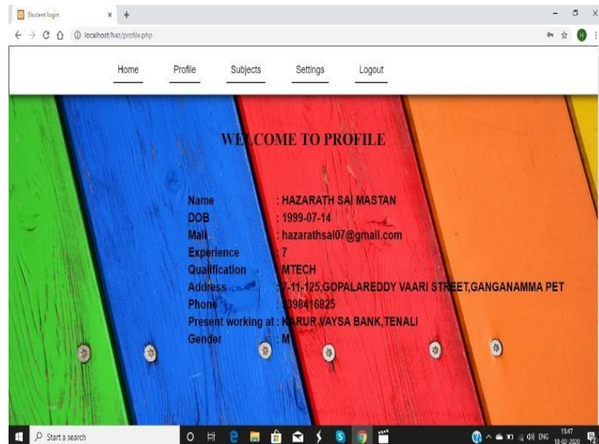
Figure 5: Profile Page