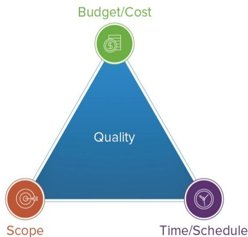
Figure 2: Shows Design Constraints

As in Figure 2 shows our main aim to develop this application is to provide the best and easiest way of learning and gaining knowledge by students with high quality and low cost. To develop this application we also considered time, scope, cost.