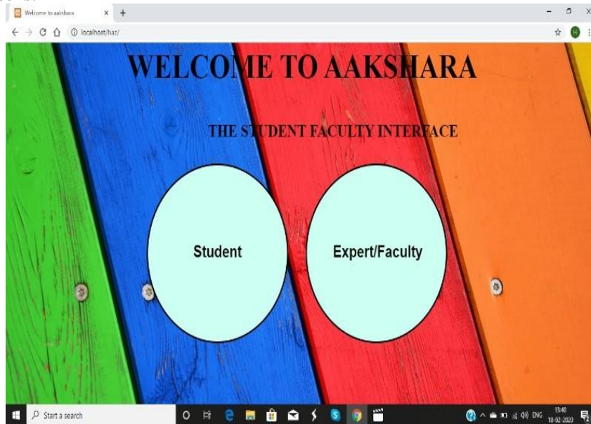
Figure 4: Home Page