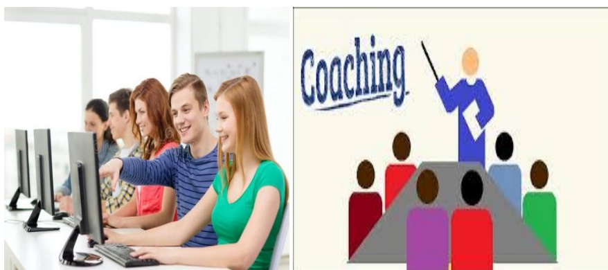
Figure 1: Gaining knowledge through online and manual

In existing system, we can learn subjects and get knowledge by using online education and online videos. We can learn from teaching institutes and tuitions. With the present system we have several problems as shown in figure 1 and some of them are