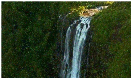
Fig.1 Salt and pepper noise frame