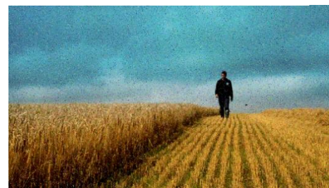
Fig.4 the noise is filtered and smoothed

In Fig.1 Salt and pepper noise frame is shown, the noise is filtered and smoothed using the proposed algorithm. The resultant image is shown in Fig.2. The same process is carried in Fig.3 and 4.