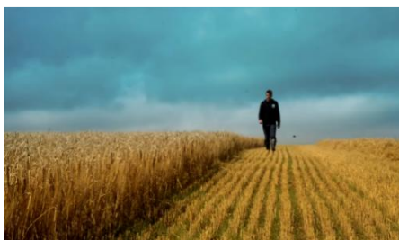
Fig.3 Salt and pepper noise frame