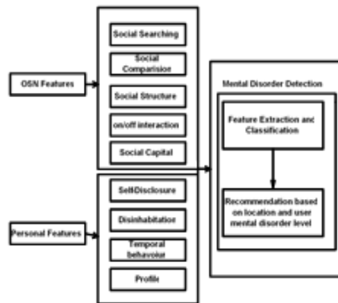
Fig 1. System Architecture