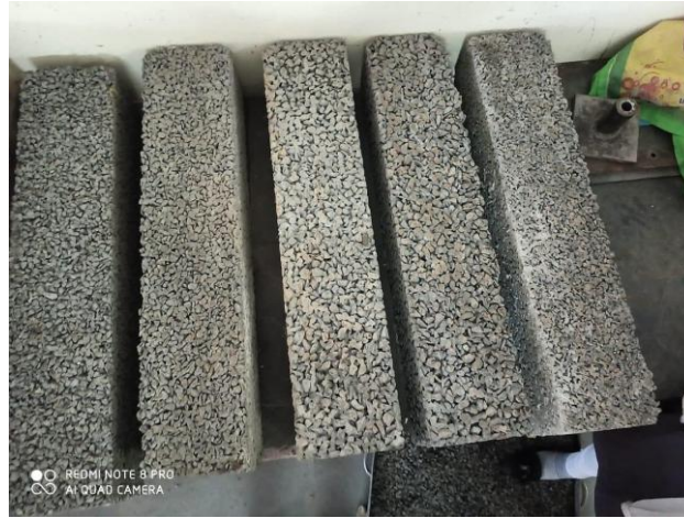
Fig. Actual Work of Project