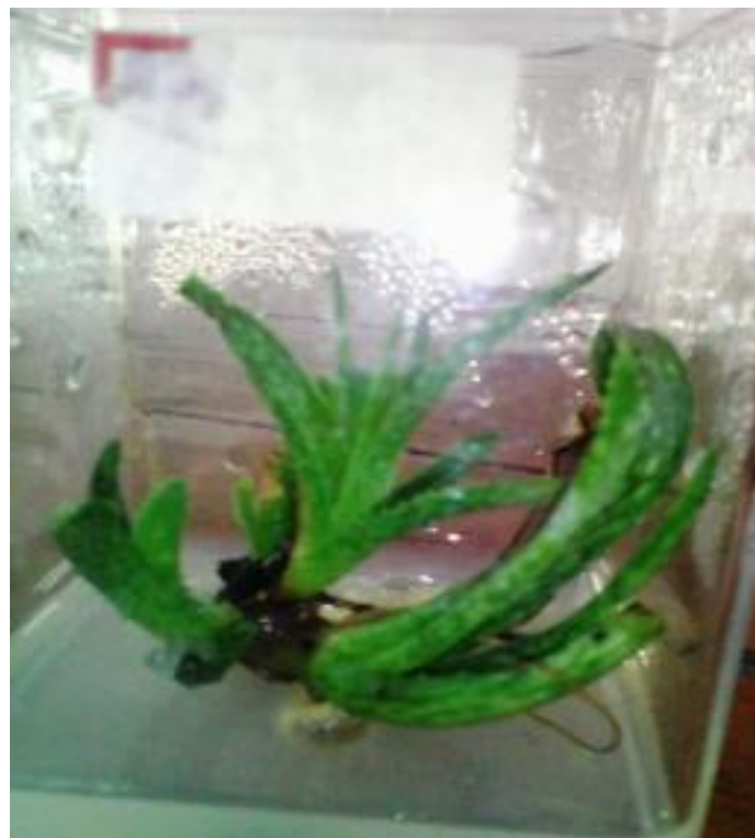
Figure 2: Showing multiple shooting and rooting in MS media