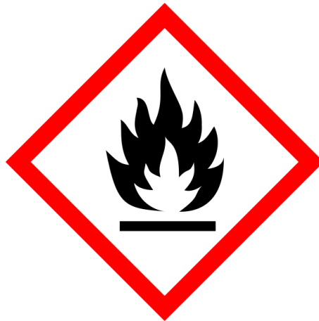
Figure 1a - Flammable symbol