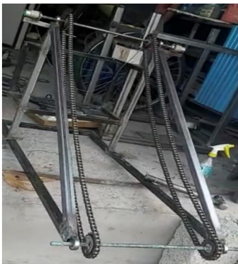
Fig. 3. Base Frame

Fig 2 shows the 3D model of the proposed system. The figure shows an overlook of the designed river cleaning machine with dimensions.