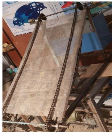
Fig. 4. River Cleaning Machine

Fig 3 shows the base frame with chain on both sides and Fig 4 shows the proposed River Cleaning Machine