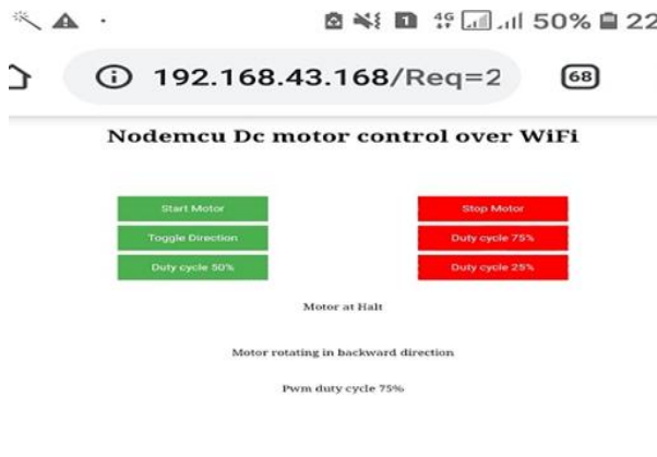
Fig. 4 Client (mobile, laptop) Output Window

To work it in proper way both the server and client must be connected to same defined network. In order to establish connection between two system given by user they must be on the same defined network. If any one of them using different network, we will not able to access webpage or we will not able to control fertilizer spraying system. As soon as we put above address in client mobile or laptop browser a web page will be seem on client side showing the controlling of motor for controlling amount of flow of fertilizer.