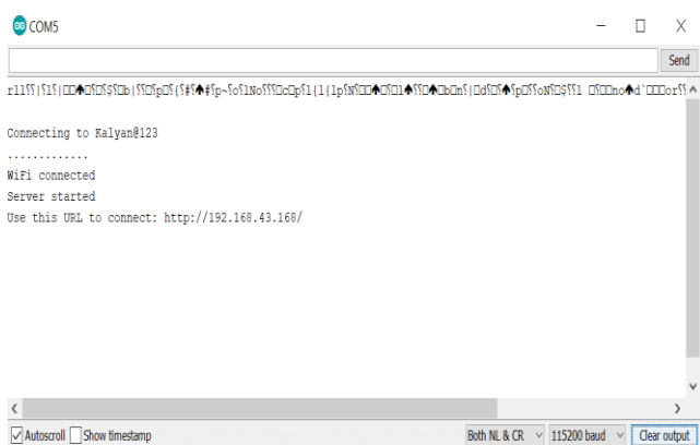
Fig.3 Arduino serial Monitor Output window

Once code uploaded in nodemcu, we have to open the arduino monitor from our arduino ide. In Arduino monitor we will see our Wi-Fi module has been requesting to the Wi-Fi router for IP allotment. After getting IP address it will starts its server. After starting its server Wi-Fi module show its server address on Arduino monitor as show in bellow fig 3. This address is the HTML address of the motor controls web page which is designed by user to operate spraying mechanism. now copy this address pest it in our web browser, after hitting enter we will see following webpage in fig.3