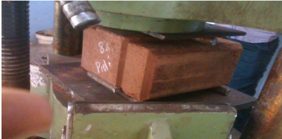
Fig. 5.Modulus of rupture test