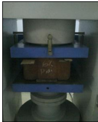
Fig.4.Compressive strength for Inter locking mud block

The blocks are made and cured for 28 days in the case of cement stabilization, the blocks made with the cement stabilizer are tested for 7th, 14th, 21th day of curing and the blocks are covered with either polythene or tarpaulin sheets and water is sprayed with water being filled in flower pot. The block is taken and they should be dried about one hour. The blocks are tested in Universal Testing machine. The test was conducted and the following are the average compressive strength obtained on the testing.