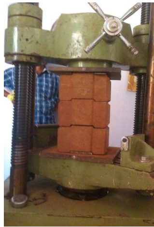
Fig .6. 3 & 5Block Prism test