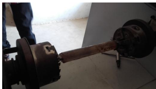
Fig 2. workpiece in Twisting Machine Table 2: Test Results for Torsion test