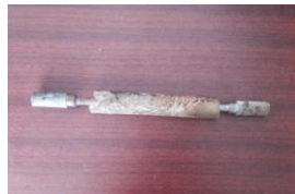
Fig 1. Composite workpiece sample

We had make the composite matrix of metals combination of two that is Steel vs. polyester and Steel vs. Epoxy. These two composite matrix are processed to bounding of 50%, 100%. The bounded work sample is subjected to Tensile, Torsion and Impact test. Tensile test is done by UTM machine. Torsion is done by Twisting machine, Impact test is accomplished by Izoid and charpy experiment test.