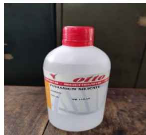
Fig.4. Potassium silicate solution

6. Potassium silicate: It is a source of highly soluble Potassium and Silicon and it is manufactured by Calcinations process that combines Silica sand (SiO 2 ) and Potassium Carbonate (K 2 CO 3 ) at 1100-2300oF for upto 15 minutes. Then the two materials fuse into glass, which can be dissolved with high pressure steam to form a slightly viscous liquid or cooled, with clear and ground into a powder form. CO 2 is evolved on it. Then the solution can be dried to form hydrous powder crystals of potassium silicate. These are manufactured as solids or thick liquids, depending on proposed use having a density from 1.6g/cubic cm to about 1.4g/cubic cm. For instance, water glass functions as a sealant in metal components. Finally, even though potassium silicate manufacture is a mature industry, there is current research for new applications given its heat conductive properties.