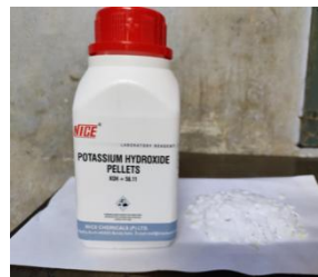
Fig. 3. Potassium hydroxide pellets

It also used in many industries as a strong chemical base in the manufacture of pulp and paper, textile, drinking water, soap and detergents and as a drain cleaner. Production in 2004 was approximately 60 million tonnes, while demand was 51 million tonnes.