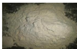
Fig. 2. Ground Granulated Furnace Slag (GGBFS)

2. Ground Granulated Blast Furnace Slag (GGBFS): GGBFS is obtained by quenching molten iron slag (a by-product of iron and steel making) from a blast furnace in water or steam, to produce a glassy, granular product that is then dried and ground into a fine powder. The chemical composition of a slag varies considerably depending on the composition of the raw materials in the iron production process. Silicate and Aluminates impurities from the ore and coke are combined in the blast furnace with a flux which lowers the viscosity of the slag. In the case of pig iron production, the flux consists mostly of a mixture of limestone and in some cases dolomite. In the blast furnace the slag floats on top of the iron and is decanted for separation. Slow cooling of slag melts results in an unreactive crystalline material consisting of an assemblage of Ca-Al-Mg silicates. To obtain a good slag reactive or hydraulicity, a slag melt needs to be rapidly cooled or quenched below 800°C in order to prevent the crystallization of merwinite and melite. To cool and fragment the slag a granulation process can be applied in which molten slag is subjected to jet streams of water or air under pressure. Alternatively, in the pelletization process the liquid slag is partially cooled with water and subsequently projected into the air by a rotating drum. In order to obtain a suitable reactivity, the obtained fragments are ground to reach the same fineness as Portland cement.