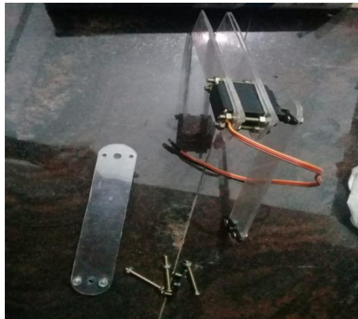
Fig.1. & Fig.2 Base, Fig.3, Fig.4 & Fig.5. Link-1 and Link-2, Fig.6. Links