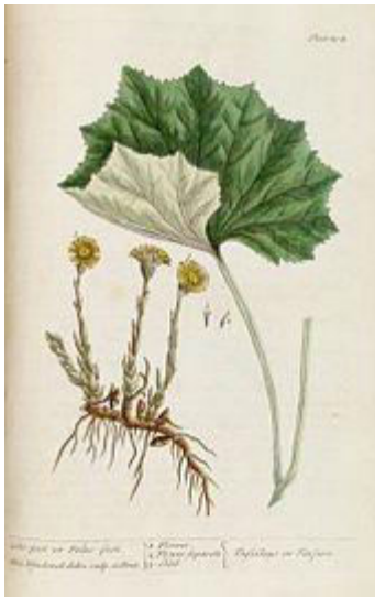
Illustration from Elizabeth Blackwell's A Curious Herbal (1737)[18,19,20]

Perhaps the best known herbals were produced in Europe between 1470 and 1670. [49] The invention in Germany of printing from movable type in a printing press c. 1440 was a great stimulus to herbalism. The new herbals were more detailed with greater general appeal and often with Gothic script and the addition of woodcut illustrations that more closely resembled the plants being described.