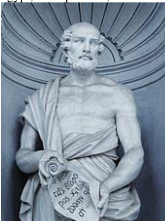
Statue of Theophrastus c. 371 – c. 287 BCE, Orto botanico di Palermo

Further information: Ancient Egyptian medicine, Ancient Greek medicine, and Medicine in ancient Rome