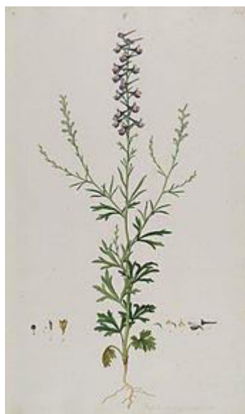
Illustration of Delphinium peregrinum in Flora Graeca by John Sibthorp and Ferdinand Bauer (1806–1840)

The legacy of the herbal extends beyond medicine to botany and horticulture. Herbal medicine is still practiced in many parts of the world but the traditional grand herbal, as described here, ended with the European Renaissance, the rise of modern medicine and the use of synthetic and industrialized drugs. The medicinal component of herbals has developed in several ways. Firstly, discussion of plant lore was reduced and with the increased medical content there emerged the official pharmacopoeia. The first British Pharmacopoeia was published in the English language in 1864, but gave such general dissatisfaction both to the medical profession and to chemists and druggists that the General Medical Council brought out a new and amended edition in 1867. Secondly, at a more popular level, there are the books on culinary herbs and herb gardens, medicinal and useful plants. Finally, the enduring desire for simple medicinal information on specific plants has resulted in contemporary herbals that echo the herbals of the past, an example being Maud Grieve's A Modern Herbal , first published in 1931 but with many subsequent editions. [87]