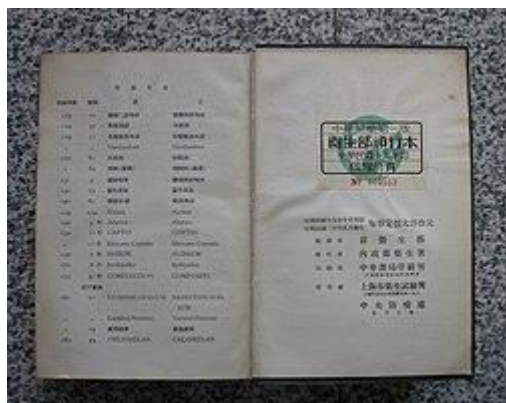
Back cover of the Chinese pharmacopoeia (1930)

The legacy of the herbal extends beyond medicine to botany and horticulture. Herbal medicine is still practiced in many parts of the world but the traditional grand herbal, as described here, ended with the European Renaissance, the rise of modern medicine and the use of synthetic and industrialized drugs. The medicinal component of herbals has developed in several ways. Firstly, discussion of plant lore was reduced and with the increased medical content there emerged the official pharmacopoeia. The first British Pharmacopoeia was published in the English language in 1864, but gave such general dissatisfaction both to the medical profession and to chemists and druggists that the General Medical Council brought out a new and amended edition in 1867. Secondly, at a more popular level, there are the books on culinary herbs and herb gardens, medicinal and useful plants. Finally, the enduring desire for simple medicinal information on specific plants has resulted in contemporary herbals that echo the herbals of the past, an example being Maud Grieve's A Modern Herbal , first published in 1931 but with many subsequent editions. [87]