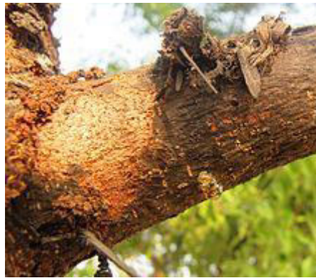
Gum arabic exuding