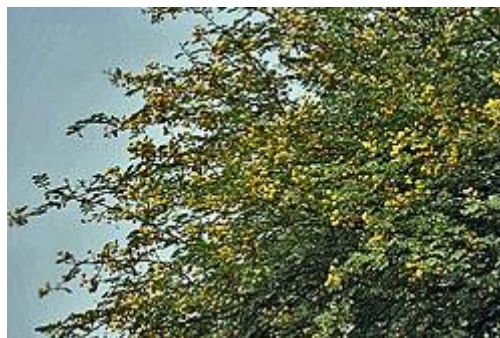
Spring blossoms at Hodal in Faridabad District of Haryana, India

Acacia nilotica or Vachellia nilotica is a tree 5–20 m high with a dense spheric crown, stems and branches usually dark to black coloured, fissured bark, grey-pinkish slash, exuding a reddish low quality gum. The tree has thin, straight, light, grey spines in axillary pairs, usually in 3 to 12 pairs, 5 to 7.5 cm (3 in) long in young trees, mature trees commonly without thorns. The leaves are bipinnate, with 3–6 pairs of pinnulae and 10–30 pairs of leaflets each, tomentose, rachis with a gland at the bottom of the last pair of pinnulae. Flowers in globulous heads 1.2–1.5 cm in diameter of a bright golden-yellow color, set up either axillary or whorly on peduncles 2–3 cm long located at the end