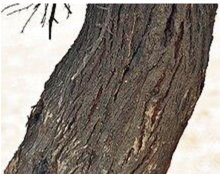
Trunk at Hodal in Faridabad District of Haryana, India