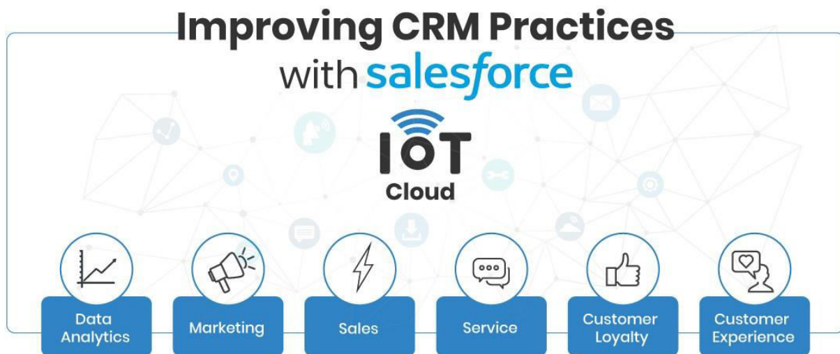
Figure 1: Improving CRM Practices with Salesforce IoT Cloud

The image captures the whole Internet of Things (IoT) revolution for CRM use: blending core domains such as data analytics, marketing, sales, [5] service, customer loyalty and customer experience into a comprehensive whole. The background interconnects structure signifies the data flow between IoT-enabled devices and the Salesforce platform with the synergy to process real time information. This dynamic integration enables customers to leverage actionable insights into customer behavior, preferences, and interactions, thus enabling first-party personalization and a data-driven approach to customer relationship management.