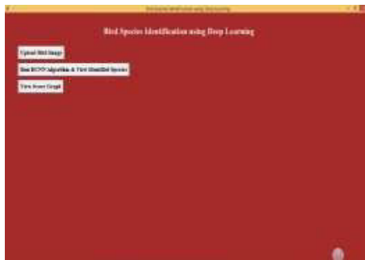
Fig. 2. Run. Bat