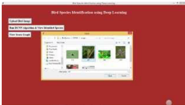
Fig. 3. Open bird image