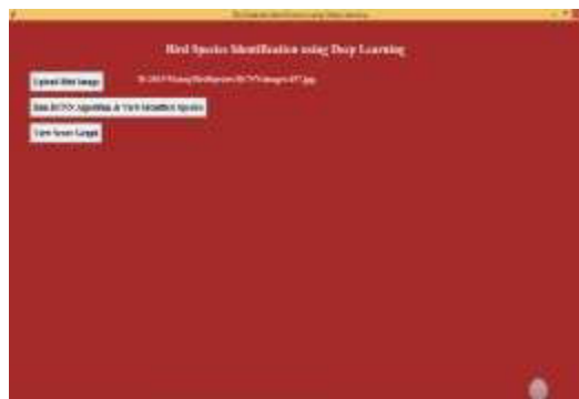
Fig 4. Run DCNN Algorithm