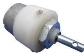
Fig 5.3 DC Motor

A DC motor is any of a class of rotary electrical motors that convert direct current electrical energy into mechanical energy. The most common type relies on the forces produced by magnetic fields. Nearly all type of DC motors has some internal mechanism, either electromechanical or electronic, to periodically change the direction of current in part of the motor.