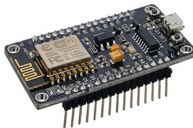
Fig 5.1 Node MCU

NodeMCU is an open-source Lua based firmware and improvement board uniquely focused on for IoT based Applications. It remembers firmware that runs for the ESP8266 Wi-Fi SoC from Espressif Systems, and equipment which depends on the ESP-12 module.