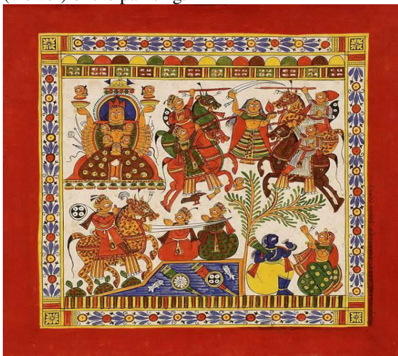
Phad Painting Durga Shakti

While figures are harmoniously distributed throughout the canvas in a Phad painting, the scale of each figure is determined by their social status, and the role they play in the story that is being narrated. A unique aspect of Phad paintings is that the construction of the figures is flat, and they all face each other, instead of facing the audience (viewer) of the painting.