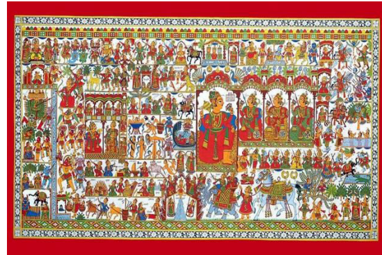
Phad Painting Ramdala

The most important detail in the paintings is added last – the eyes. Once the main deity's eyes are painted, the artwork comes alive, and is ready for worship. After this, the artist cannot sit on the artwork (which they would otherwise do, owing to the size of the paintings). The artist signs the artwork close to the image of the main deity, which is typically placed in the centre of the painting.