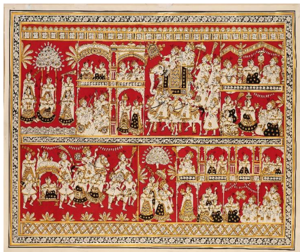
Phad Painting Wedding Celebration