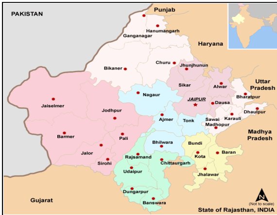
Map: State of Rajasthan

conjunction with an all-night performance. This is possibly why these paintings are called Phad which means folds in local dialect. All Phad paintings have certain common features. Every available inch of the canvas is crowded with figures. Another similarity is flat construction of the pictorial space. While the figures are harmoniously distributed all over the area, the scale of figure depends on the social status of the character they represent and the roles they play in the story.