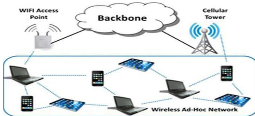
Figure 1: General Architecture of Ad-Hoc Network

the paths were to fail. Single-path or link stability need to repair routes each time the route is broken, therefore these type of issues solve by using multipath. So we implemented a multipath routing algorithm based on the AODV protocol in our work. In addition, multipath routing has the advantages of balancing load, minimizing end to end delay, increasing fault-tolerance, reducing the frequency of route inquiries and achieving a lower overall routing overhead. The main goal in the design of the algorithm is to receive the maximum packet for routing and find out efficient metrics. Furthermore, in this thesis the performance of AODV in terms of packet delivery fraction and NRL is analyzed by varying the mobility and node density parameters through simulation results using NS-2 simulator.