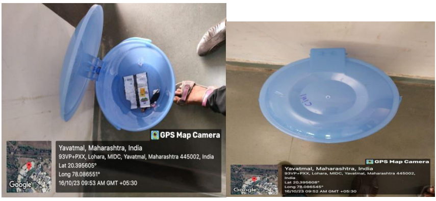
Fig 2: Small dustbin, capacity 26lit

We provided smaller dustbin which is of size 20 litters are placed in each classroom, laboratories, library, departmental offices and workshops. Placing large dustbins on ground floor and smaller ones on first and second floor can help facilitate waste collection and make it more convenient for the servants. To collect the waste from 1<sup>st</sup> and 2<sup>nd</sup> floor and bring it to the ground floor, we can use designated collection points on each floor.