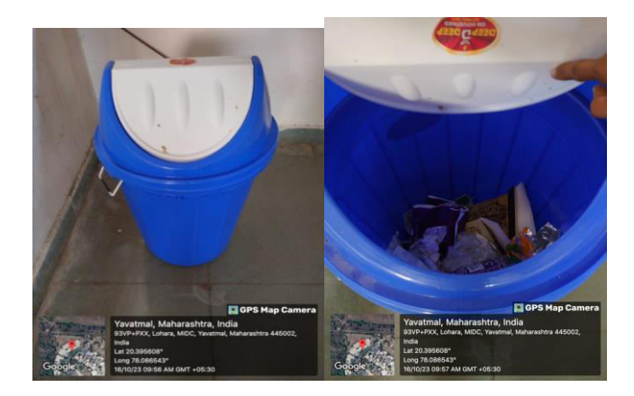
Fig 1: large dustbin, capacity 60lit

Firstly, we mark the location of the dustbin. Basically, we put 7 numbers of large dustbin on the ground floor which is of size 60 litters of capacity. These 7 numbers of dustbin are provided at each and every department of the college.