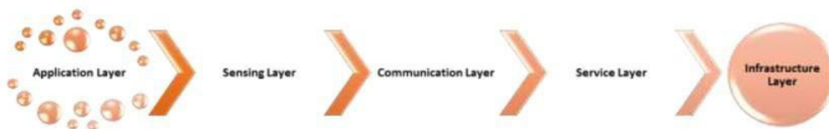
Fig. 2. IoT System Architecture.

All these parameters must be sensed and transferred to the service layer through an appropriate communication channel. The service layer then makes the necessary decisions to control the system according to the requirements. The relevant and sensed data is stored in the infrastructure layer.