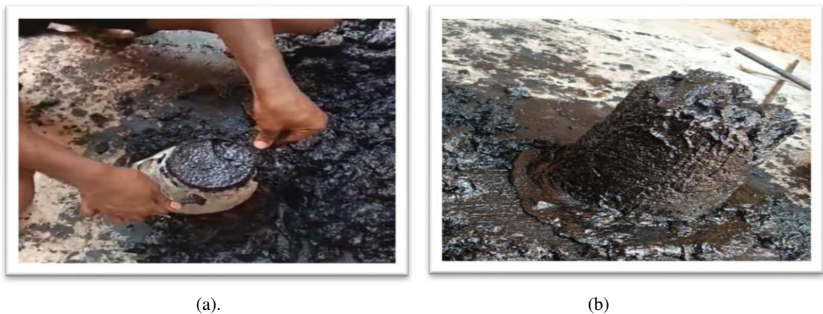
Figure 3 (a)&(b): Slump test of coal ash with different percentage of jute fibre