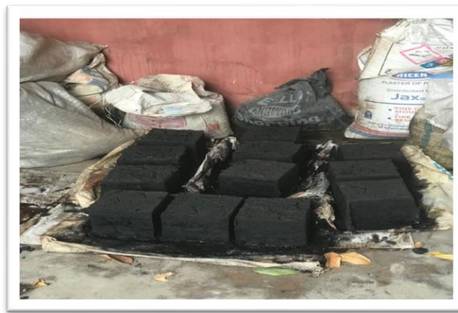
Figure 2: compressive strength cube samples after demoulding

CALCIUM CHLORIDE (CaCl 2 ): Calcium chloride is a preferred additive for accelerating coal ash hydration and reducing set time for concrete applications,. It can enable concrete to be produced faster. Calcium chloride was gotten from a chemical vendor at Plateau state.