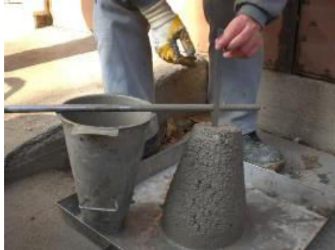
Fig.(4) Slum Test