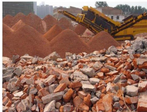
Fig (2) Brick slag

Slag bricks are a type of construction brick that incorporates slag as a raw material. Slag is a byproduct of various industrial processes, including metal smelting and steel production. When processed and mixed with other materials, slag can be used to make bricks.