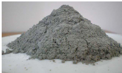
Fig (3) Fly ash

Fly ash is a fine dust that is a byproduct of burning coal in a power plant. It is collected from flue gases using electrostatic precipitators or other particle filtration equipment. Fly ash is a useful product with a variety of uses, especially in homes and businesses.