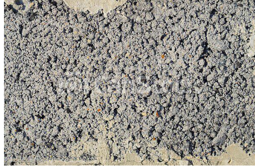
Fig (1) Concrete slag

Concrete slag, often referred to as slag concrete or slag cement, is a type of concrete that incorporates slag as a partial replacement for Portland cement. Slag is a by-product of the iron and steel manufacturing process and is often used in construction to enhance the properties of concrete.