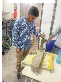
Testing of specimens with Half-cell Potentiometer.