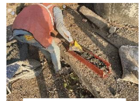
Casting of specimens.