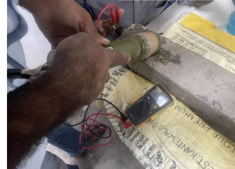
Testing of specimens with Half-cell Potentiometer.