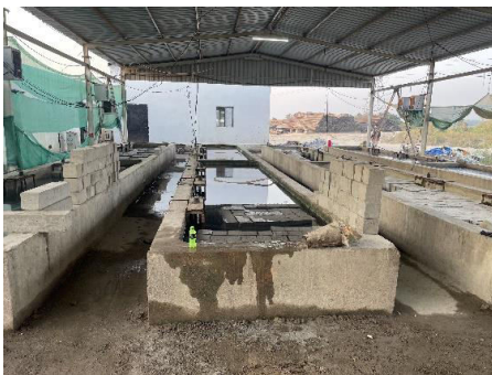
Curing in special Saline tanks.