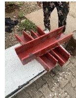
Wooden Concrete beam moulds.