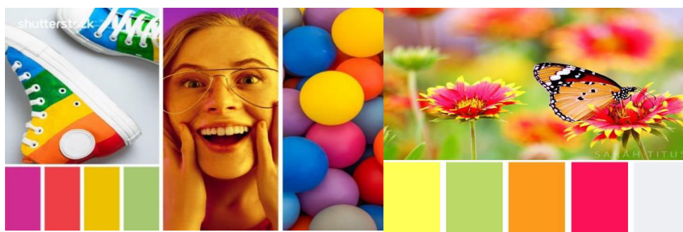
Gay, Happy & Cheerful Colours

JOYFUL HUES: Vibrant and cosy hues like yellow, orange, pink, and red are indicative of happiness. Pale hues such as peach, light pink, or lilac can help elevate one's spirits and create a cheery atmosphere. The hues' paler and brighter tones create a Yellow is widely acknowledged as the happiest colour in the world, and science supports this prestigious title. Maybe the most vibrant and vigorous colour is yellow. It is linked to joy, optimism, and brightness. Yellow hues will energise you and give you a positive, upbeat feeling. Numerous researches have connected yellow's psychological properties to the Sun.