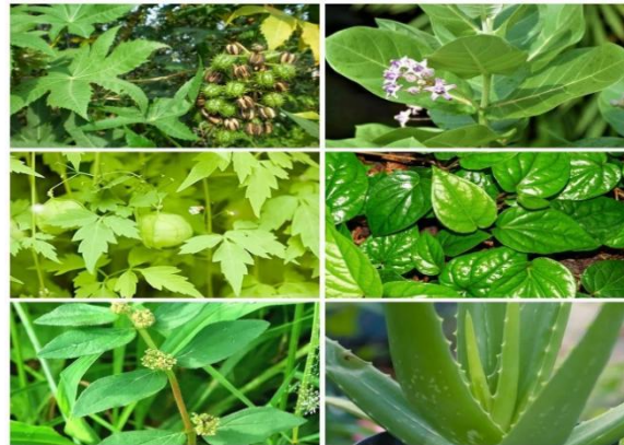
FIG 2 Medicinal plant leaf samples

identification project. By sourcing high-quality images and applying rigorous quality control measures, the project will develop a robust dataset that supports the accurate and reliable identification of medicinal plant leaves using deep learning techniques. This comprehensive approach ensures that the final model is well-equipped to handle the diverse characteristics of medicinal plant leaves and contributes to advancements in botanical research and herbal medicine development. Some of the sample medicinal plant leaves are shown in fig.3.2.